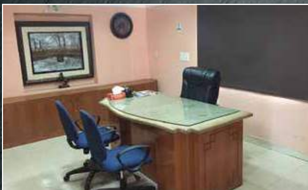
Master Interview cabin