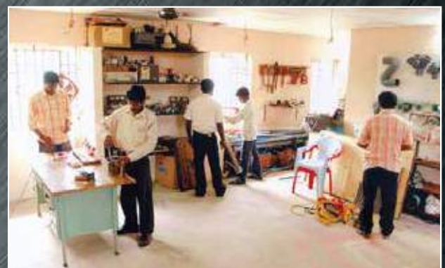
Transcend Electrical Testing Lab