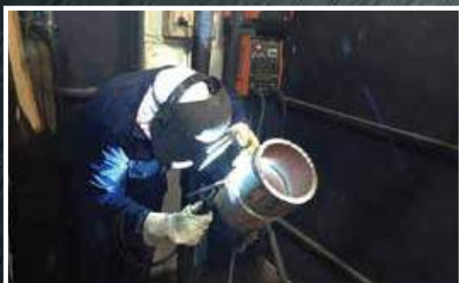
TIG Welding Test