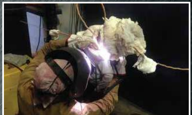
Specialized Welding Test