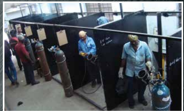
Welding Trade Test