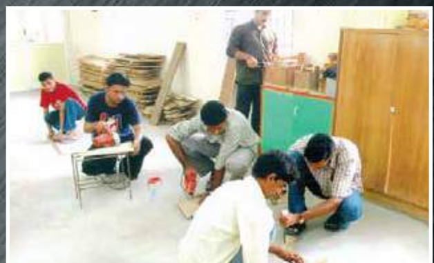
Furniture Carpenter Test