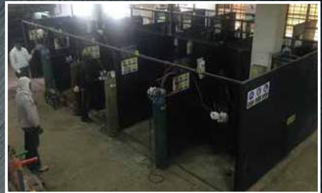
Transcend Welding Testing Lab