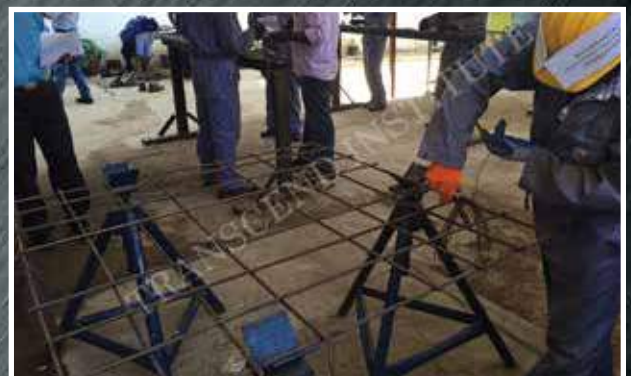
R.C.C Fitter/Steel Fixer Test